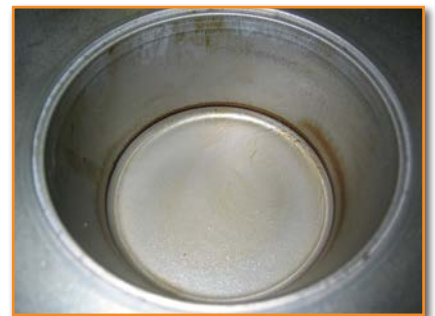
F6284 – Enhanced Biodegradable Hydraulic Fluid