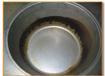
Vegetable-Oil-Based Hydraulic Fluids