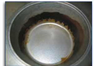
The lower thermal stability of competitive fluids often leads to increased carbon and varnish buildup