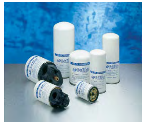
SPIN-ON AIR/OIL SEPARATION