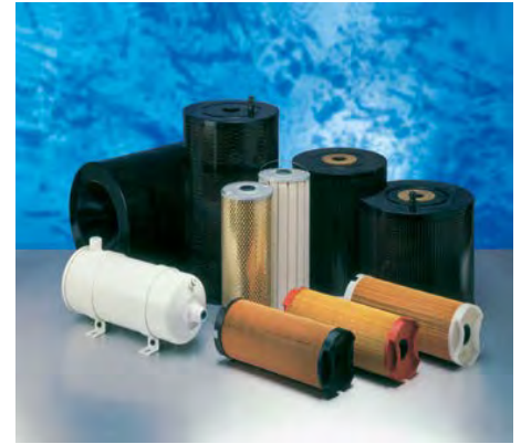
SPARK EROSION FILTERS