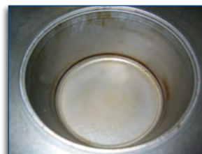
Fai Filtri's air compressor lubricants are highly thermally stable, providing enhanced resistance against carbon and varnish formation