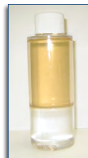
Fai Filtri's line of air compressor lubricants resist water contamination; typically separating in two distinct layers.