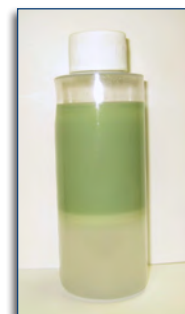
Competitive fluids often form an emulsion when contaminated by water.